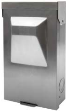
Stainless Steel Housing