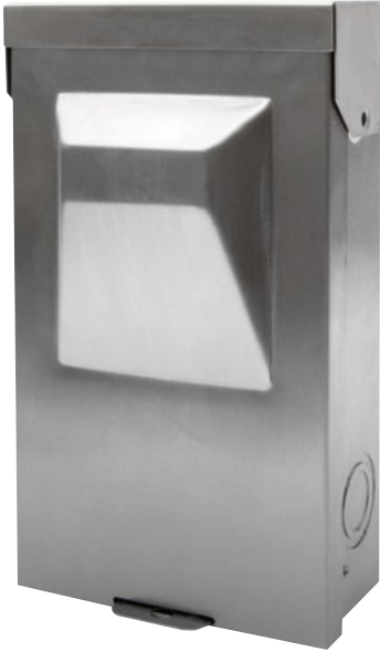
Stainless Steel Housing