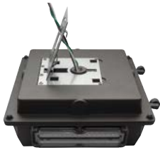
AIVGS40Q w/ Easy-Hang Bracket (NM) Stamped Steel 2-Piece Bracket Allows One-Person Installation. Mounts Directly to Standard 4" Electrical Box