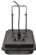
AIVGS40Q w/ Adjustable Trunnion Mount (T) Stamped Steel Height Adjustable Trunnion, Powdercoat Finish, Includes Hardware