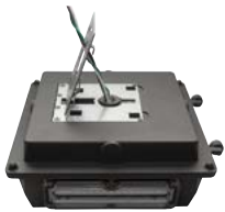
Easy Hang Mount (NM)

See Page 3 for Projected Lumen Maintenance Table.