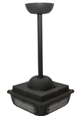
AIVGS40Q w/ Pendant Mount (PA) Includes Top and Bottom Covers, Brackets, and 3/4" Diameter, 15" Long Downrod, Powdercoat Finish, Includes Hardware.