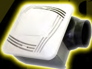
AI BFV80UQ 80 CFM