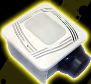
AI BFV80LEDUQ 80 CFM LED Light