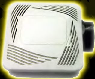
AI BFV150UQ 150 CFM