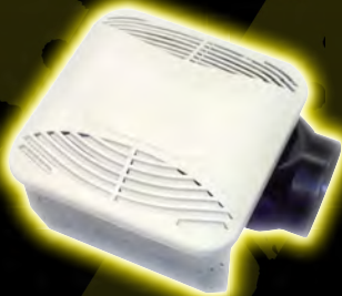
AI BFV110UQ 110 CFM