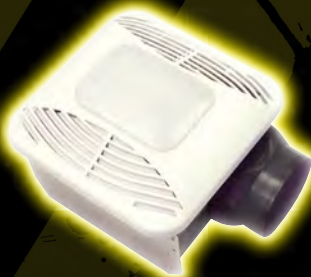
AI BFV110LEDUQ 110 CFM LED Light