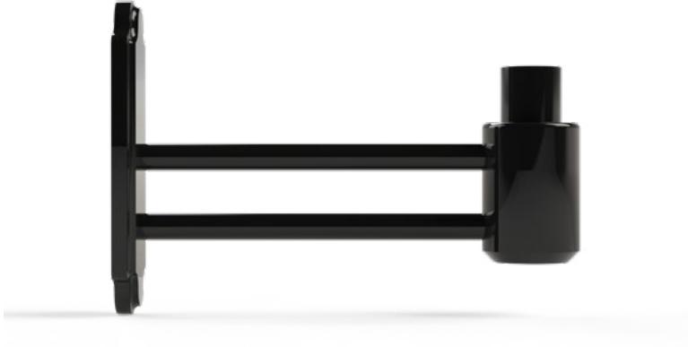
AIWMPC491SGWMTEN Tenon Wall Mount