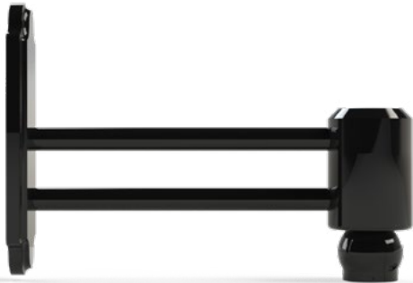
AIWMPC491SGWMPEN Pendant Wall Mount

Order Information Example: AIWMPC491SGWMTENBK