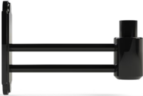
AIWMPC491SGWMTEN Tenon Wall Mount