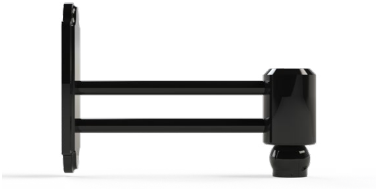
AIWMPC491SGWMPEN Pendant Wall Mount