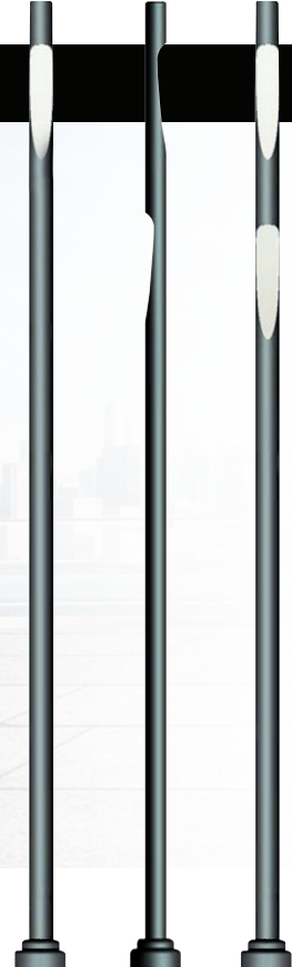
4.5" Dia. X 8', 10', 12' High