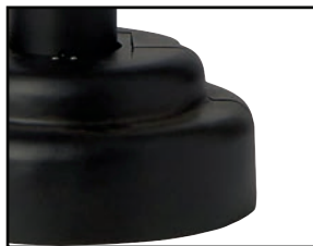
Decorative Clamshell Base Cover for Light Column

The AIB11 product family offers a unique contoured form factor that provides uniform scaled design elements for exterior pedestrian spaces. Each high-performance 20W light engine has fully shielded optics to eliminate LED source glare for walkway illumination and architectural accents to denote building entrances and points of interest.