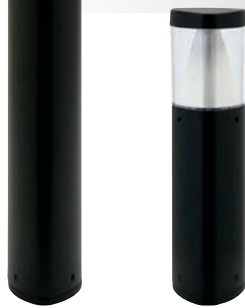
15" Pathway Bollard available.