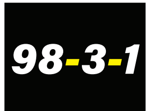
98% Fill Rate 3 day Lead Time 1 piece minimum order