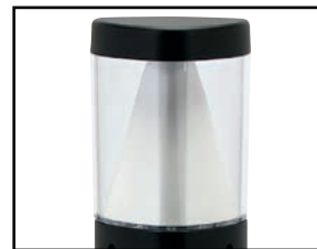
Sleek lines with lasting durability