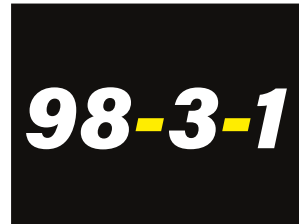
98% Fill Rate 3 day Lead Time 1 piece minimum order