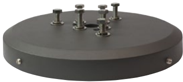
(Cover with Bollard Anchorage)