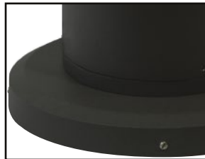
Bollard Retrofit Base (see reverse)